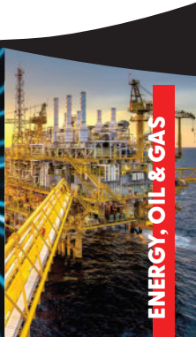
ENERGY, OIL & GAS