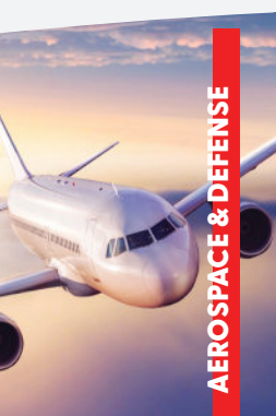
AEROSPACE & DEFENSE