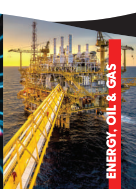
ENERGY, OIL & GAS